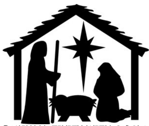
FAMILY NATIVITY WITH CAROLS

By the way the Coronation Hall has been having a new lick of paint, it's well underway and should be completed by the end of January. With the busy hall schedule finding a couple of days together for the final bits to be done has been challenging. It's looking smart already!